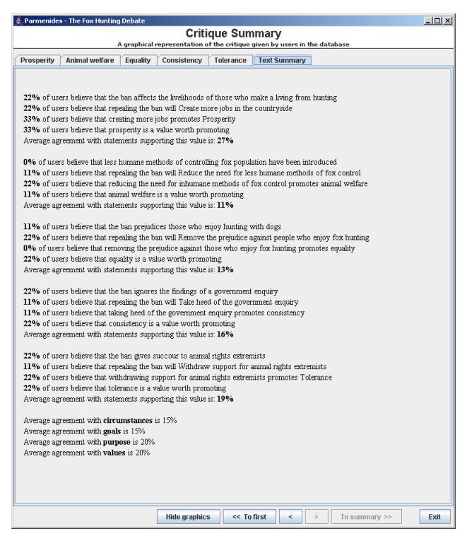
Figure 2. Critique statistics summary.

by the node. One VAF is constructed for each of the social values promoted by the initial position of the debate, and within each framework a node is assigned to this social value. All nodes representing social values promoted by alternative positions attack the value promoted by the initial position, within each framework.